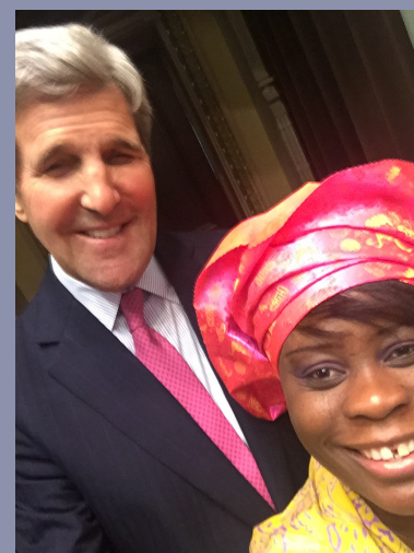
A selfie with Secretary of State, John Kerry at the White House

Human Trafficking Advocacy Tour Reaches Over 20 Million Worldwide