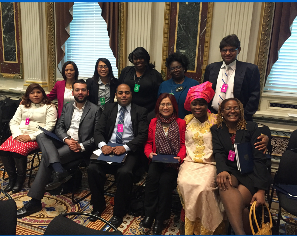
Members of the U.S. Advisory Council on Human Trafficking

However, 11 survivors were appointed to serve a two year term, which is renewable. They come from diverse backgrounds, and will recommend ways the federal government can adapt their policies to serve victims and survivors of human trafficking. It was mandated under the Justice for Victims of Human Trafficking (JVTA) of 2015. The Human Trafficking Empowerment Act, part of the JVTA, affirms the need for survivor input in the development of policies.